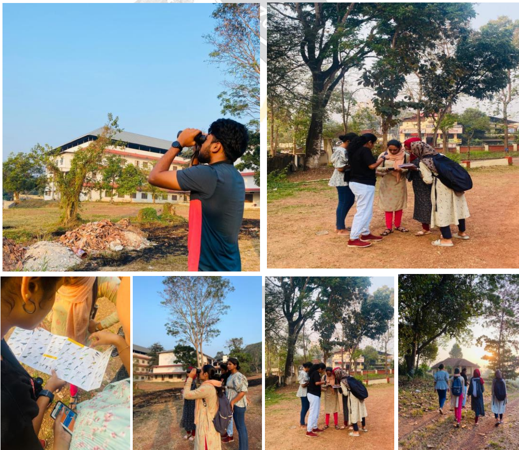
Students during the Avifauna survey at UC Campus, Aluva

A survey was conducted to study the diversity of birds in the Union Christian College campus located in Aluva, Ernakulam, Kerala. The survey involved club members and experienced faculty members from the college. Birds were identified based on their color, feathers, flight patterns, and vocalizations. During the investigation, a total of 21 bird species belonging to 20 different genera and 15 different families were observed. Most of the bird species belonged to the Megalaimidae family, which consists of Asian barbets. In addition to the common bird species found in the area, such as Pigeons, Greater Coucals, Brahminy Kites, and Racket-tailed Drongos, we were fortunate to observe some less abundant species during the survey. These included the Purple-rumped Sunbird ( Leptocoma zeylonica ), Common Tailorbird ( Orthotomus sutorius ), Blue-throated Barbet ( Psilopogon asiaticus ), Red-wattled Lapwing ( Vanellus indicus ), and Golden Oriole ( Oriolus oriolus ). The presence of these less common species highlights the conservation significance of the Union Christian College campus.