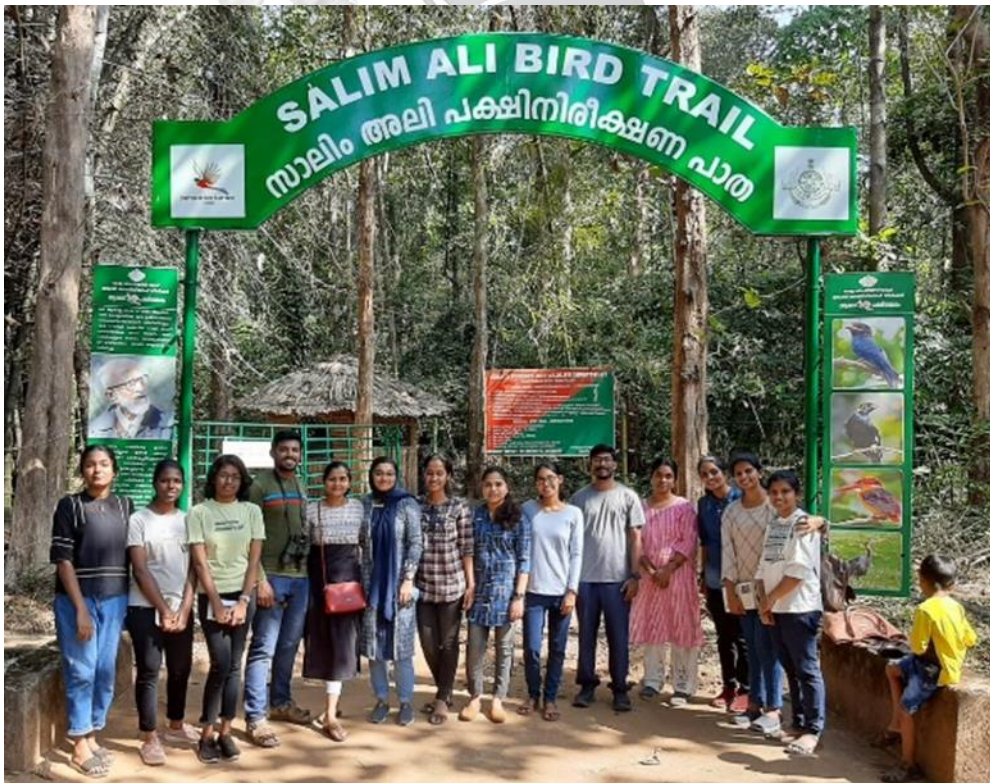
Students visiting Salim Ali Bird Sanctuary at Thattekad

The visit to Thattekad Salim Ali Bird Sanctuary was a mesmerizing experience for our club members. The journey started on 25/02/2023 from UC College campus at 6:30 am. Field trip consisted of 11 students and 3 faculties. Thattekad Salim Ali Bird Sanctuary, also known as Thattekad Bird Sanctuary, is located in the Kothamangalam Taluk of Ernakulam district in Kerala, India. It was established in 1983 and is named after the renowned Indian ornithologist Dr. Salim Ali. The sanctuary covers an area of about 25 square kilometers and is situated on the banks of the Periyar River. We discovered a treasure trove of avian wonders with each step along the well-marked trails. The vibrant plumage of the Indian Pitta, the melodious calls of the Malabar Grey Hornbill, and the elusive Sri Lanka Frogmouth perched on a branch captivated our senses. The expertise of our knowledgeable guide further enhanced the experience as we learned about the diverse bird species and their habitats. It was truly a memorable visit that deepened our appreciation for the remarkable biodiversity of Thattekad Salim Ali Bird Sanctuary.